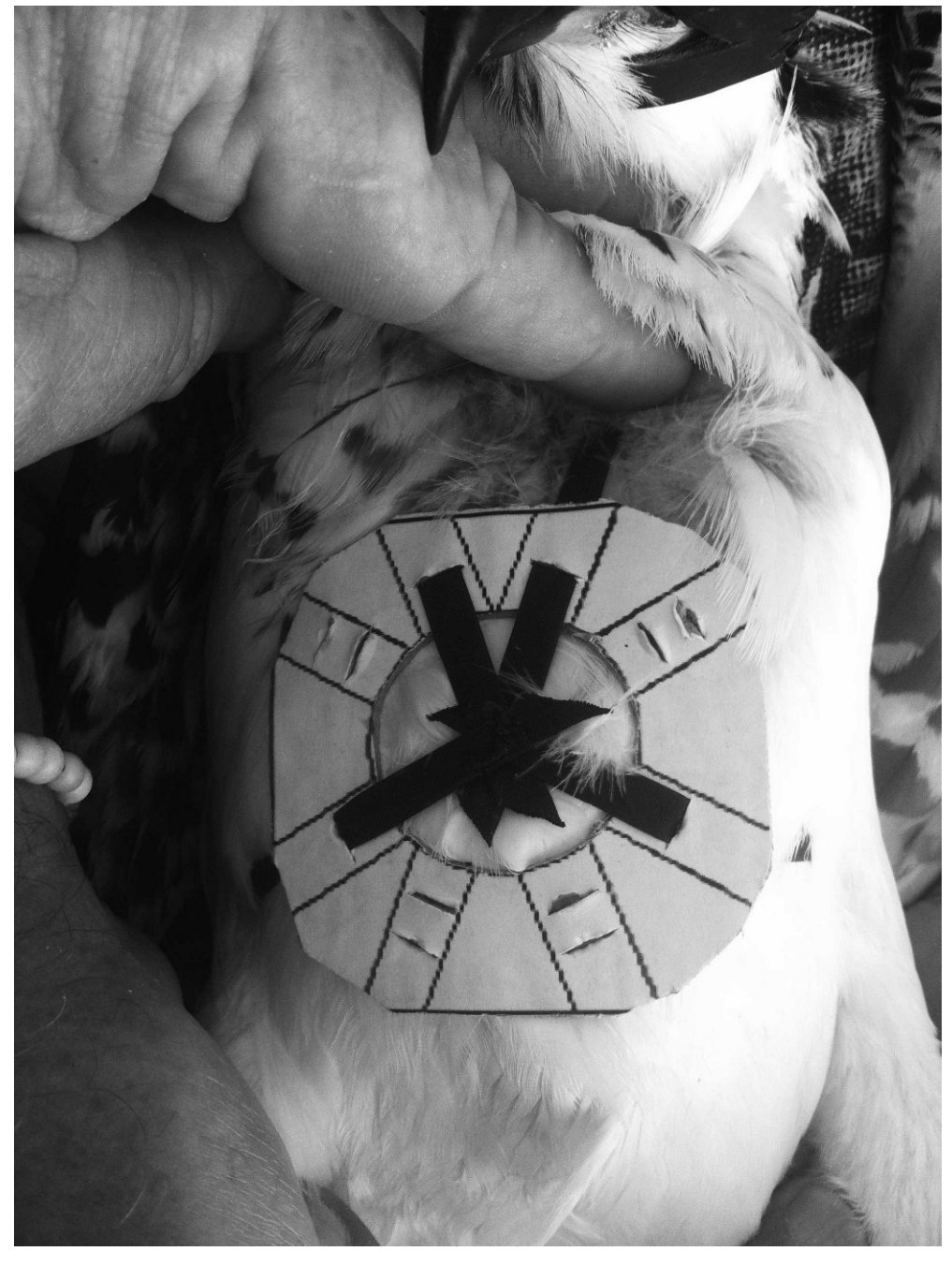
Figure 2. Osprey with harness in place. The stitching is complete, the excess straps have been cut, and the template is ready to be cut away.

Using a curved needle, I stitch together the four straps where they cross over the sternum prior to cutting away the template. When I thread the needle for stitching, I use a double strand of nylon thread. I tie a knot and leave about